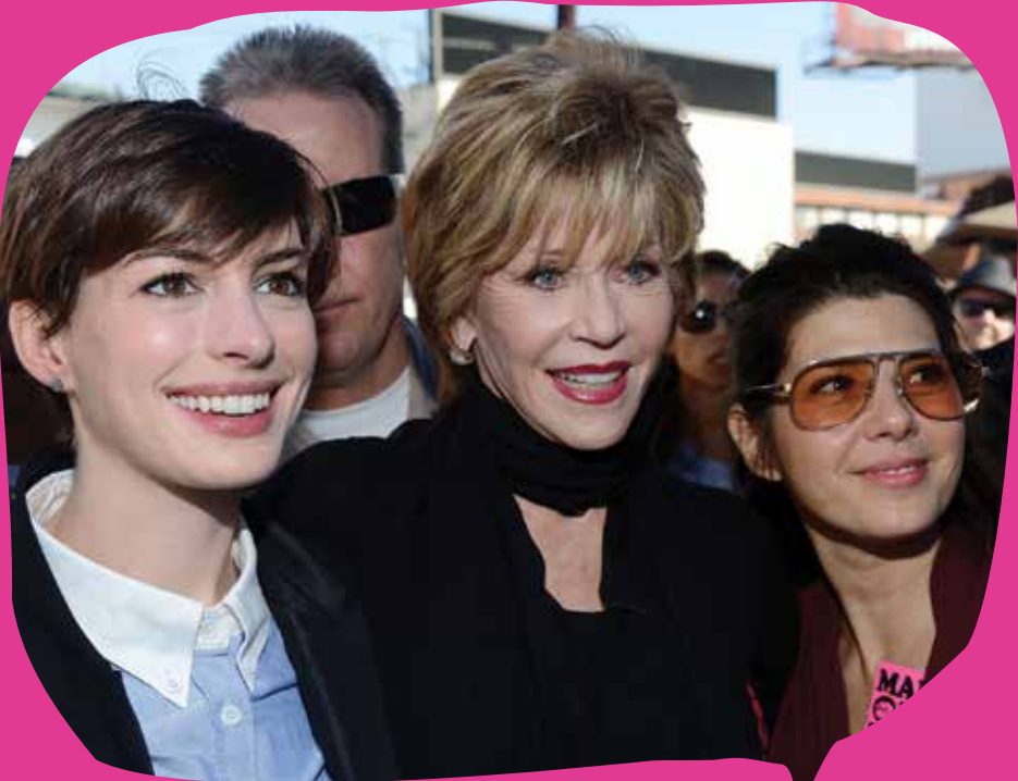
Anne Hathaway, Jane Fonda and Marisa Tomei

It's part of my life. It's like breathing. Once you know about the plight of fellow human beings and there's something you can do – it's a vocation that keeps me up at night. One in every three women will experience violence in their lifetime. Once you know that, you want to do something about it. You just look at the world in a different way, and you want to improve the world for your children and for your children's children.