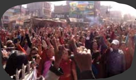
NEPAL went Gangnam style when a flash mob took over Patan Durban Square