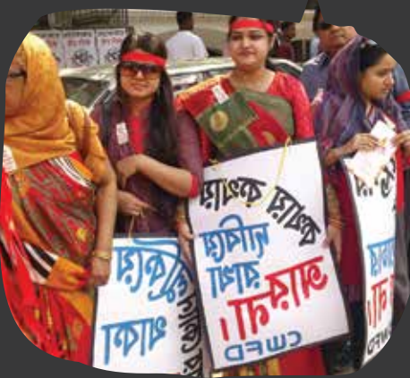
64 districts in BANGLADESH organized flash mobs, V-Men workshops, concerts, and theatre performances