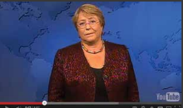
Michelle Bachelet, Former President of Chile