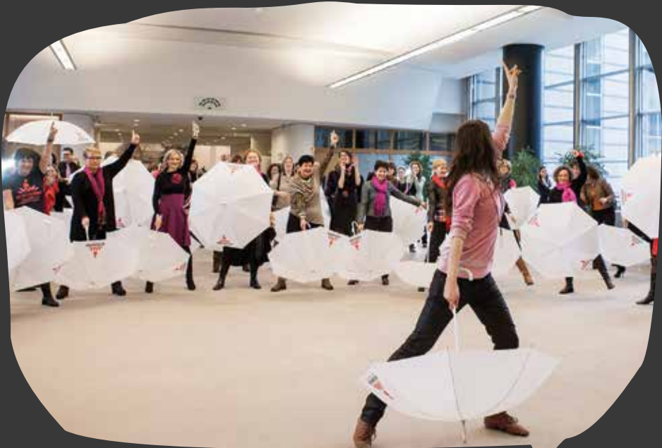
The European Parliament Rose in BELGIUM

The City of Lima in PERU held events throughout the city – in campuses, plazas, and women’s prisons – with TV spots airing every 30 minutes on the biggest network