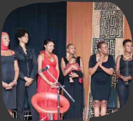
KENYA rose with a main event in Nairobi with dozens of organizations leading – and with singing and dancing in Central Park