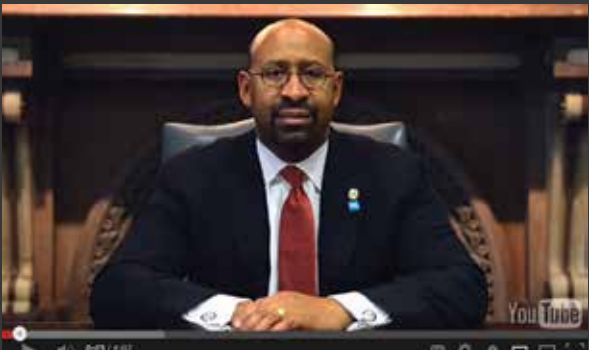
Michael Nutter, Mayor of Philadelphia