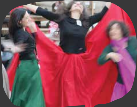
The Skirts Up Movement and Beintuitive raised their skirts to denounce an end to violence against women and girls in SPAIN and around the world