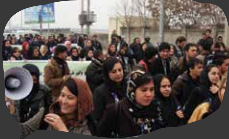
In AFGHANISTAN a huge march took place in Kabul