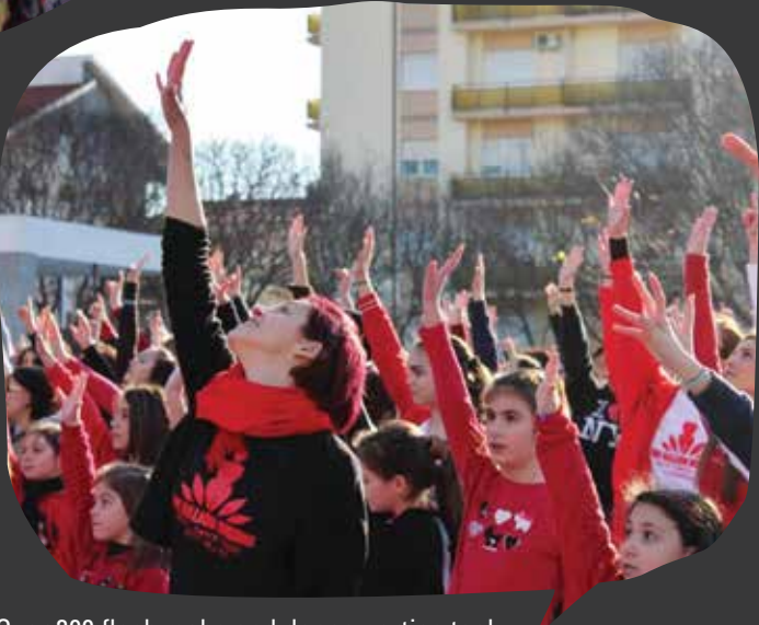
Over 200 flash mobs and dance parties took place in more than 120 cities in ITALY