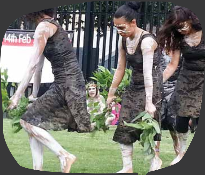
Aboriginal women in AUSTRALIA hosted a "Rites of Passage to a Violent Free Life" event