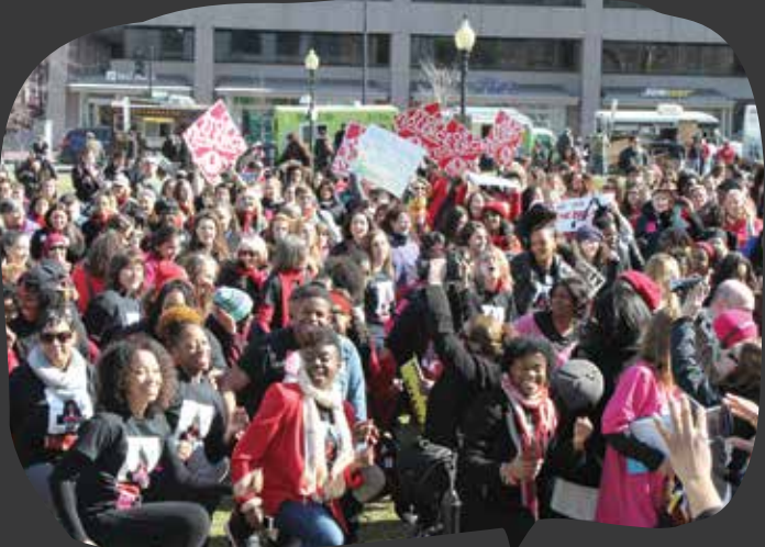
In the U.S. – major events took place in San Francisco, Los Angeles, New York, Atlanta, and countless cities and towns – with thousands of groups leading the risings – together with celebrities, singers, DJ's, and political figures