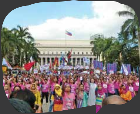
National leaders of Gabriela and leaders of Gabriela's sectoral organizations, lead the One Billion Rising PHILIPPINES campaign inspiring activists on all 7,000 islands to Rise.

The next day, ending violence against women was on the lips of every person in Mexico.