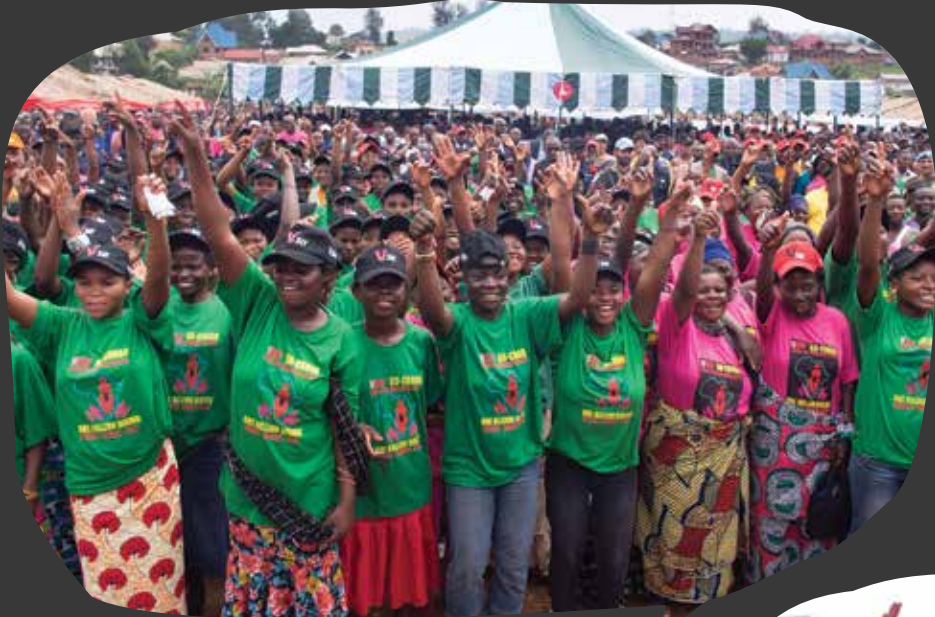
Eve spent the rising with thousands of activists in CONGO

THERE WERE TENS OF THOUSANDS OF EVENTS ACROSS THE WORLD, SOME KEY HIGHLIGHTS INCLUDED: