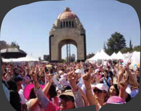
MEXICO rose with countless performance events and flashmobs around the country