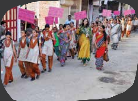
Cities and villages rose with colorful and creative events, dances, marches, and rallies across INDIA – with network groups mobilizing hundreds of thousands of people across the region