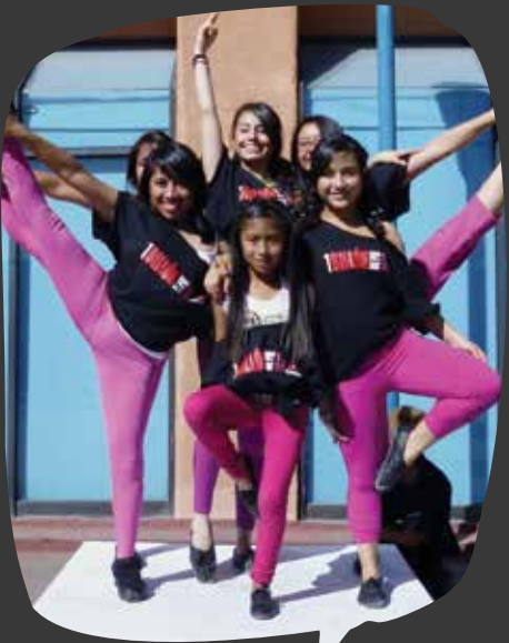
9th and 10th graders in Caracas, VENEZUELA rose and danced

One Billion Rising is a joyous recognition of the sacred and how it must never be made profane by any person, institution or government. Violence and the oppression of women is the core wound that foreshadows all other problems in the world, from poverty to war to destruction of the environment. Rising is not only dance, it is the birth of the future.