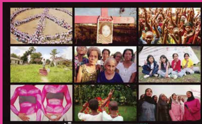
What is V-Day?

V-Day dreams of a world in which women and girls will be free to thrive, rather than merely survive. With your help, we are making it happen.