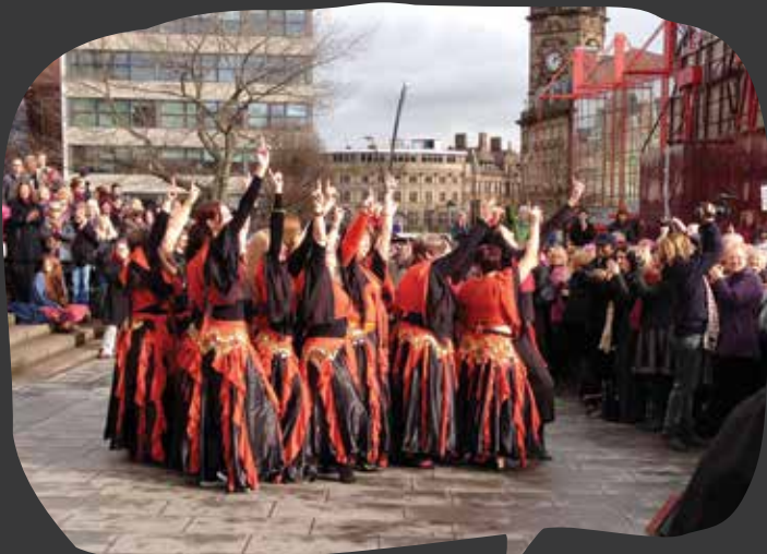
In the U.K. - a lead up event called "London Rising" featuring well known artists and musicians became the prelude for 220 risings that took place around the country