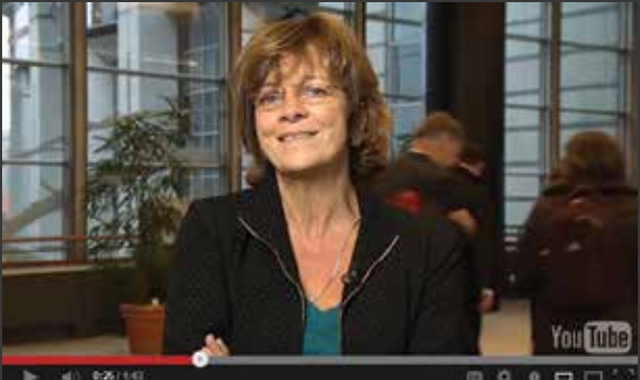
Isabelle Durant, Belgium, Vice President of the European Parliament