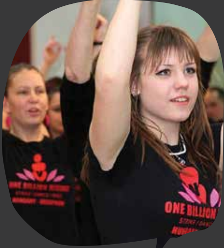
In HUNGARY flash mobs and public events were held throughout the country

Live performances, marches, and rallies were held throughout CANADA