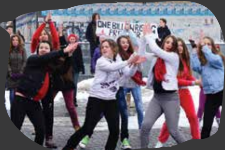
Dancing parades by a network of organizations along the river in Sarajevo, BOSNIA & HERZEGOVINA