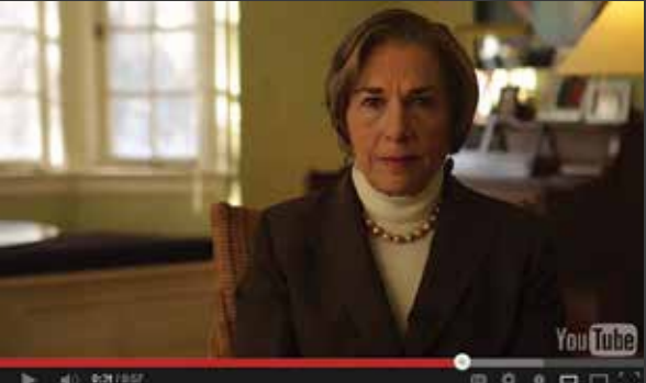
Jan Schakowsky, U.S. Representative

We don’t have to accept that violence against women is part and parcel of life. We can change these things. That’s why we’re voting in parliament next week to make sure that sex and relationship education is mandatory for all young people, so that we start changing ideas and changing cultures about what is acceptable in a relationship. Stella Creasy, British MP