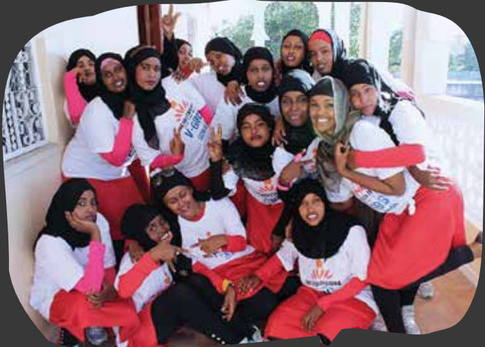
Women met in homes in SOMALIA to learn the flash mob. A march and rally took place in the city’s public courtyard, the first of its kind....and activists worked closely with traffic commissioners to ensure a ‘safe’ road to march down