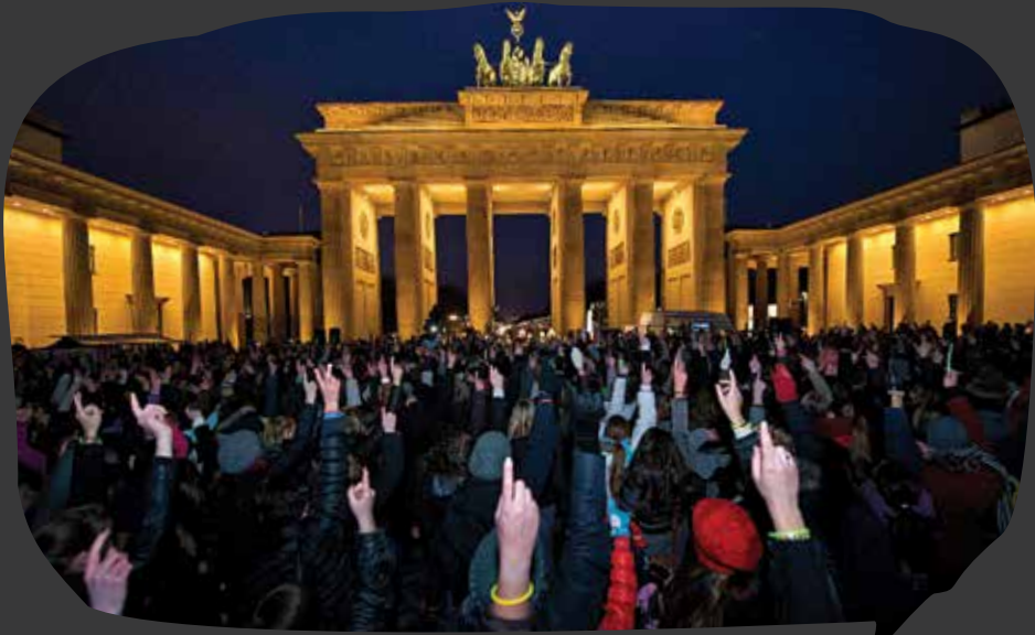
Over 300 cities rose in GERMANY and thousands danced in public squares