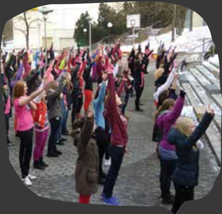
Activism in art events and demonstrations were held in IRELAND

Paul Hawken Renowned Environmentalist & Author of Blessed Unrest