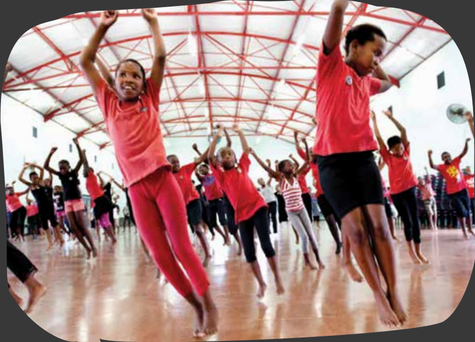
In SOUTH AFRICA V-Girls rose in Soweto and other places, creating a beautiful dance video – with flash mobs taking place in several cities